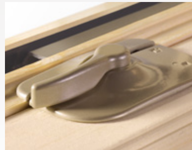
Hung dual action lock