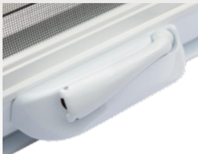
Stainless steel LTS mechanism with folding handle