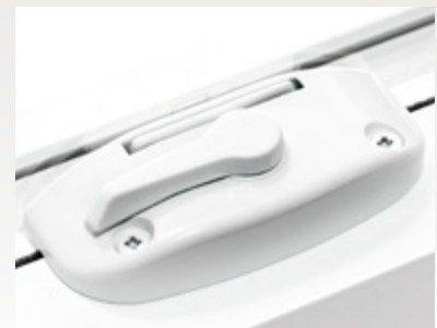
Hung and Slider lock