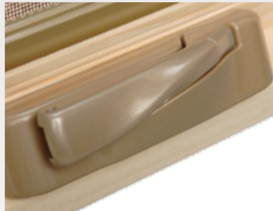
Truth hardware's bronze ENCORE line